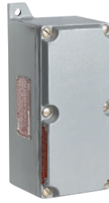
Style 3 - SWBC-16

Class I, Div. 1 & 2, Groups C, D Class I, Zones 1 & 2, Groups IIB, IIA Class II, Div. 1 & 2, Groups E, F, G Class III NEMA 7 (C, D) 9 (E, F, G) SWBC Series: