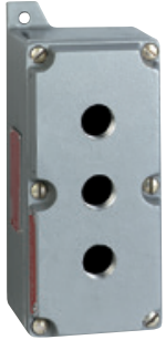
Style 1 - GCS-16