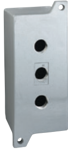
Style 2 - GCS-163